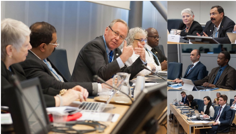
WSIS 2016

IGFSAs role as a channel for additional funding for the IGF Trust Fund has been recognized by the UN through an exchange of letters. To date, IGFSAs has contributed USD 280,000 to the UN IGF Trust Fund and USD 429,500 to the NRIs.