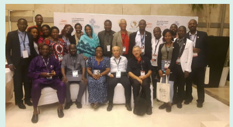
Above: Representatives of NRIs who benefited from IGFSAs funding at the African IGF 2018 in Khartoum.

"We are grateful to the IGFSAs for supporting the logistics of the first national IGF in the English speaking Caribbean. To ensure the broadest participation, we innovated with a YouTube Live channel to stream the event beyond the confines of the physical location, and support remote participants with full participation. This TTIGF was extremely well received, and has been recognized as a leading IG event in the entire English speaking Caribbean. We are already planning the 2018 TTIGF, and are working with other countries in the region to share our IGF planning process." -T&T IGF