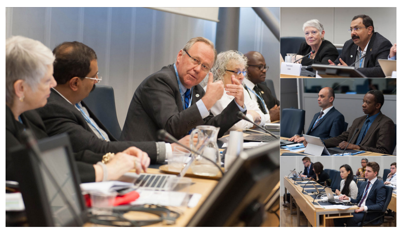
WSIS 2016

IGFSA's role as a channel for additional funding for the IGF Trust Fund has been recognized by the UN through an exchange of letters. To date, IGFSA has contributed USD 280,000 to the UN IGF Trust Fund and USD 475,000 to the NRIs.