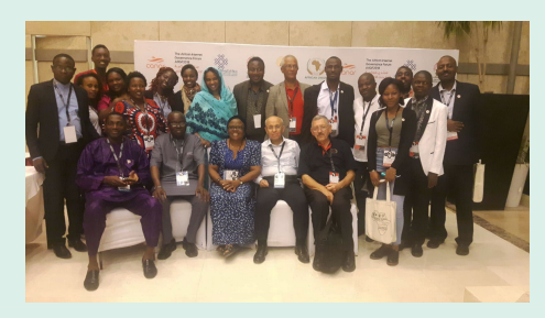
Above: Representatives of NRIs who benefited from IGFSA funding at the African IGF 2018 in Khartoum.

"We are grateful to the IGFSA for supporting the logistics of the first national IGF in the English speaking Caribbean. To ensure the broadest participation, we innovated with a YouTube Live channel to stream the event beyond the confines of the physical location, and support remote participants with full participation. This TTIGF was extremely well received, and has been recognized as a leading IG event in the entire English speaking Caribbean. We are already planning the 2018 TTIGF, and are working with other countries in the region to share our IGF planning process." -T&T IGF