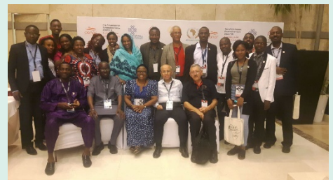
Above: Representatives of NRIs who benefited from IGFSAs funding at the African IGF 2018 in Khartoum.

"We are grateful to the IGFSAs for supporting the logistics of the first national IGF in the English speaking Caribbean. To ensure the broadest participation, we innovated with a YouTube Live channel to stream the event beyond the confines of the physical location, and support remote participants with full participation. This TTIGF was extremely well received, and has been recognized as a leading IG event in the entire English speaking Caribbean. We are already planning the 2018 TTIGF, and are working with other countries in the region to share our IGF planning process." -T&T IGF