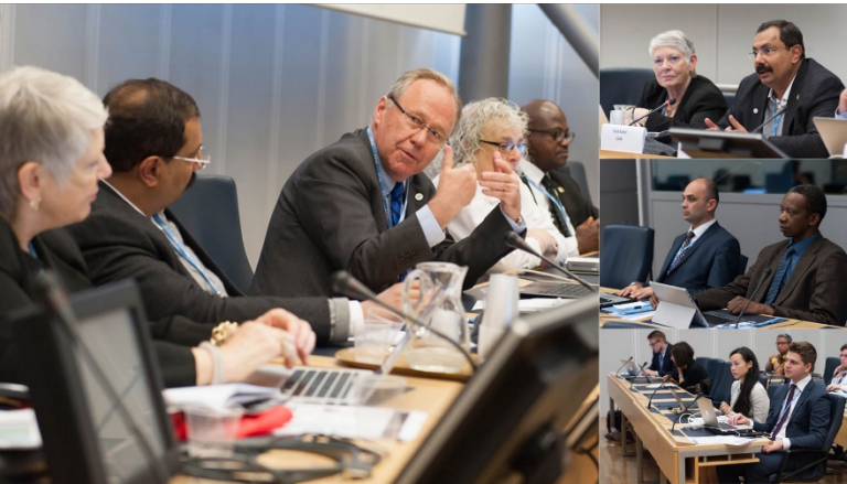
WSIS 2016 – Photo credit: ITU Pictures (Flickr)

IGFSAs' role as a channel for additional funding for the IGF Trust Fund has been recognized by the UN through an exchange of letters. To date, IGFSAs have contributed USD 270,000 to the UN IGF Trust Fund and USD 386,000 to the NRIs.